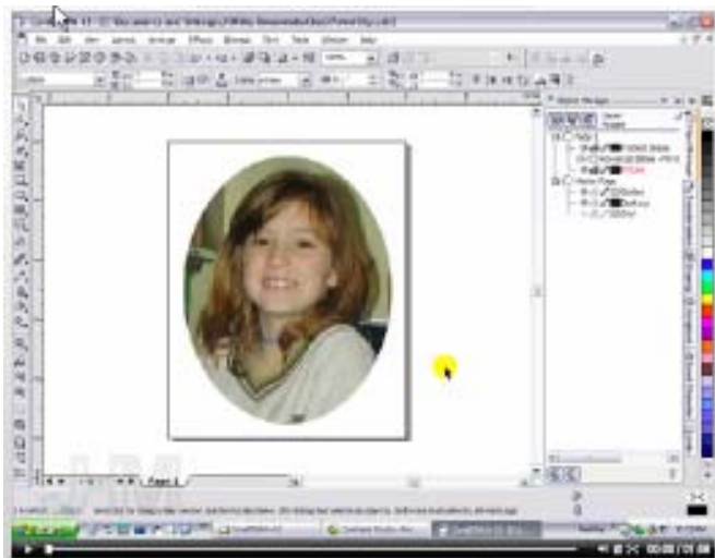
Screen shot from Feathering the Edge (version 12)

as part of the association's new Premium Membership